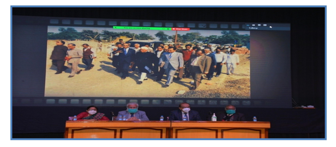
Some initial pictures describing the journey of this great organization were displayed, Occasion Alumni Day 2020